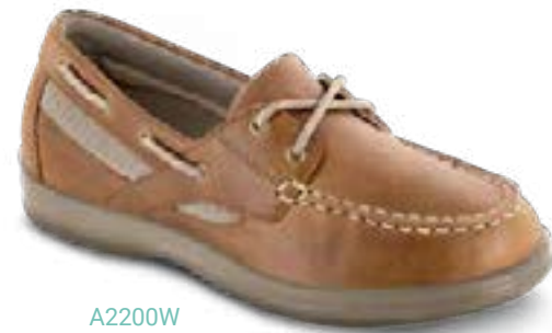
A2200W Color: Camel Sizes: 5-11, 12, 13 Widths: M, W, XW Depth: 5/16"