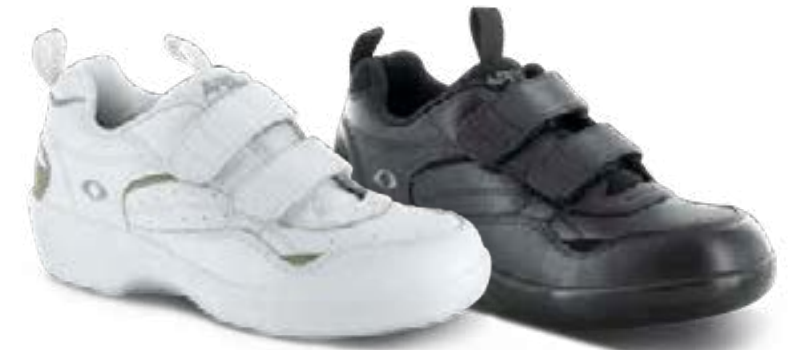
G8210W Color: White Sizes: 4.5-11, 12, 13 Widths: M, W, XW Depth: 1/2"