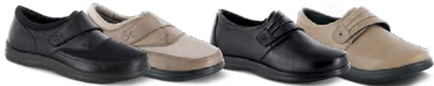
A720W Color: Black Sizes: 5-11, 12, 13 Widths: M, W, XW Depth: 5/16"