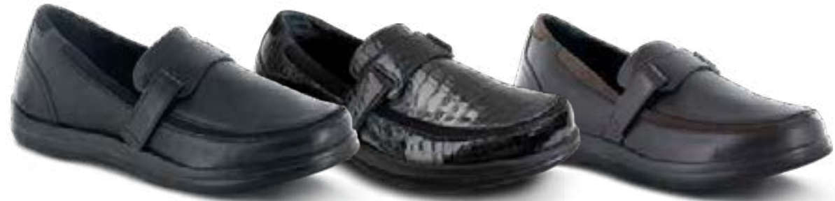
A200W Color: Black Sizes: 5-11, 12, 13 Widths: M, W, XW Depth: 5/16"