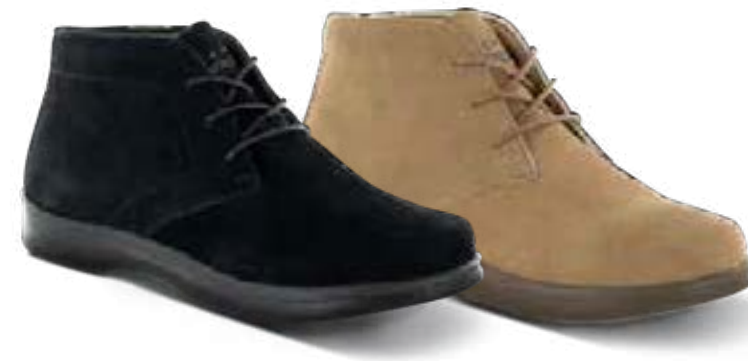
A500W Color: Black Sizes: 5-11, 12, 13 Widths: M, W, XW Depth: 5/16"