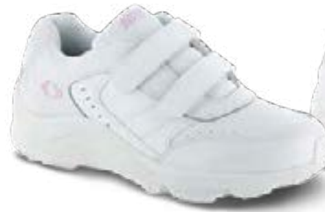
V952W Color: White/Pink Sizes: 4.5-11, 12, 13 Widths: M, W, XW Depth: 5/16"