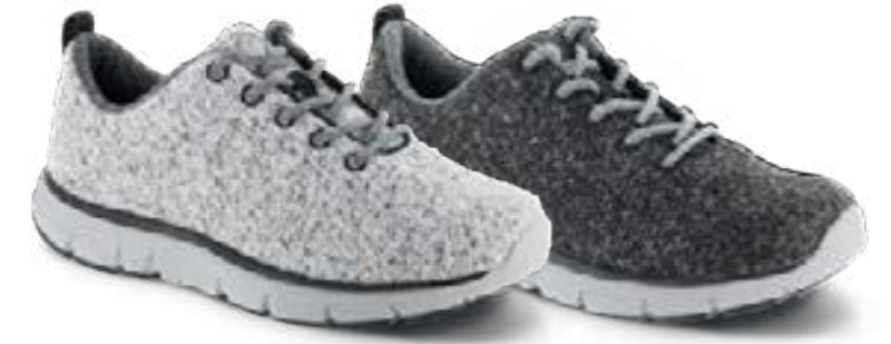
A8000W Color: Light Grey Sizes: 5-11, 12, 13 Widths: M, W, XW Depth: 5/16"