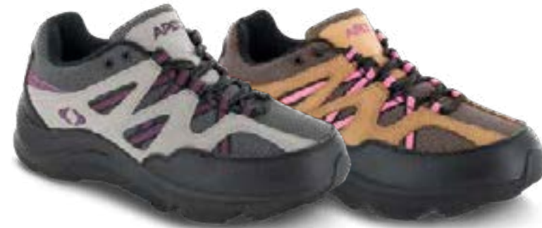
V753W Color: Grey/Purple Sizes: 4.5-11, 12, 13 Widths: M, W, XW Depth: 5/16"