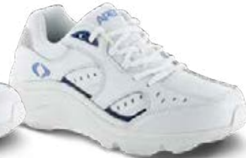
V854W Color: White/Periwinkle Sizes: 4.5-11, 12, 13 Widths: M, W, XW Depth: 5/16"