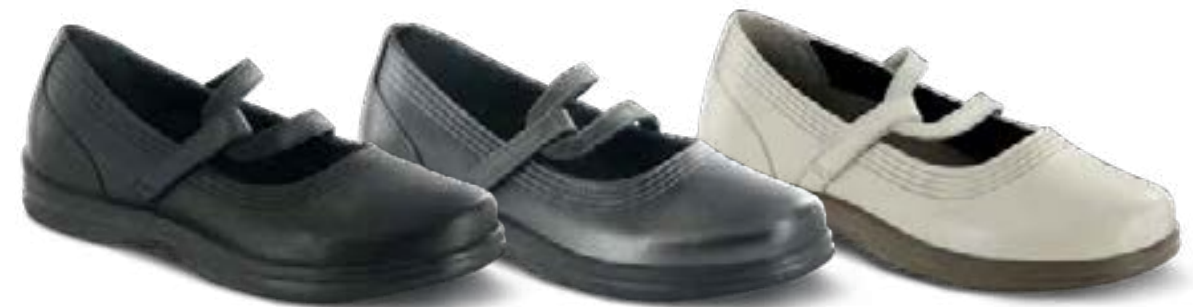
A300W Color: Black Sizes: 5-11, 12, 13 Widths: M, W, XW Depth: 5/16"