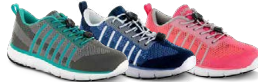
A7000W Color: Grey Sizes: 5-11, 12 Widths: M, W, XW Depth: 5/16"