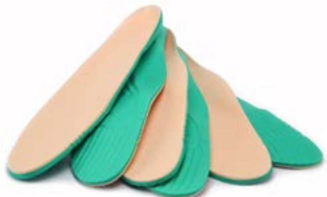
308 Diabetic Inserts - A5512

Sizes & Widths: 9306, 9315, 3310 D/W: 5,5.5 - 11.5, 12 3E(WW): 5,5.5 - 11.5, 12 5E(XW): 5,5.5 - 11.5, 12