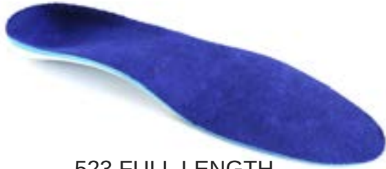
523 FULL LENGTH