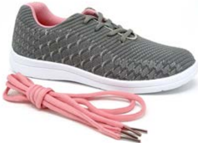
9327 Grey Knitted Walking Added Depth

Sizes & Widths: 9327 B/D(M/W): 5,5.5 - 10.5, 11 3E(WW): 5,5.5 - 10.5, 11 5E(XW): 5,5.5 - 10.5, 11