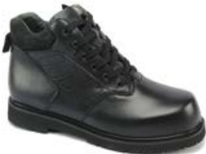
9703-2L Hiking Boots