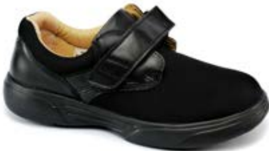
9326 Black Expandable Entrance