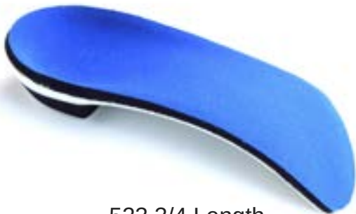
523 3/4 Length