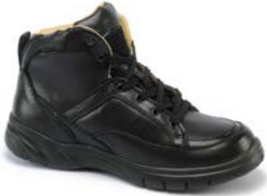
9606 Lace Black