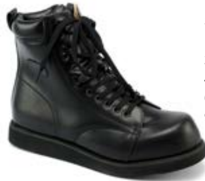
504 Black 8" Boots Supra Depth / Medial Zipper

Sizes & Widths: D: 5 - 11.5, 12 - 17 2E: 5 - 11.5, 12 - 17 4E: 6 - 11.5, 12 - 17 6E: 7 - 11.5, 12 - 17 9E: 7 - 11.5, 12 - 17