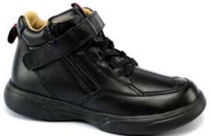
9215 Black 5" Boots