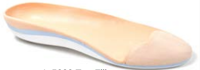
L-5000 Toe Filler