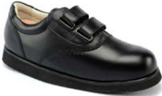
9301-C Charcot Last Black

Size: 5 - 10.5, 11- 15 Width: B, D, 3E, 5E, 7E