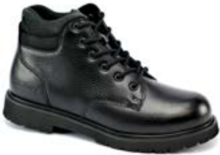
9951 6" Boots Black