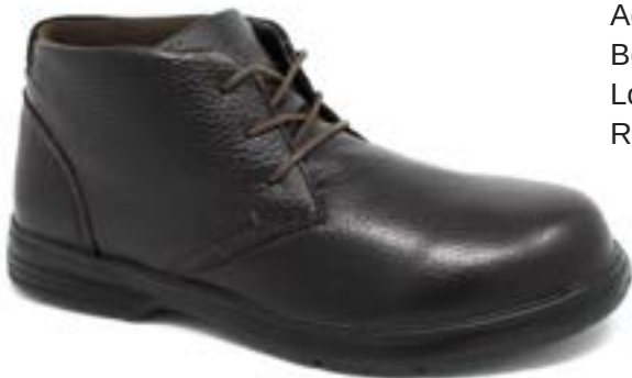
9603 Chucka Boots Brown